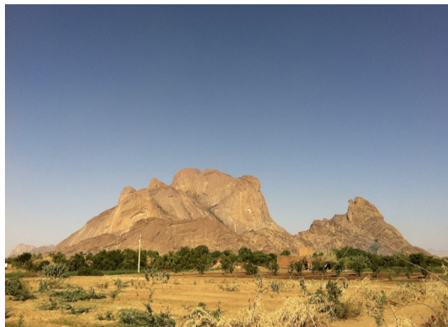
Jebel Totil

We take the bus back at 4.40pm and usually get home around 5.15pm. The university has a chef who prepares home-cooked meals for all the staff. Shortly after we get back, she knocks on our door and hands us a tray laden with food; a mountain of rice, white bread and a big pot of piping hot Sudanese stew. The food is delicious and extremely hearty, though I'm not sure how healthy it is for me to be overdosing on all these carbohydrates. After dinner my stomach is so heavy that I usually have to lie down and give myself time to recover! There isn't much to do in the evenings but we do have a television which has a few English channels so we usually just veg out in